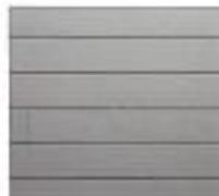
Horizontal Hardie Plank Lap & Tail (Light Grey)