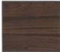
Horizontal Aluminum Lap & Tail Longboard (Dark Grey w/ Vary- ing Wood Grain and Color)