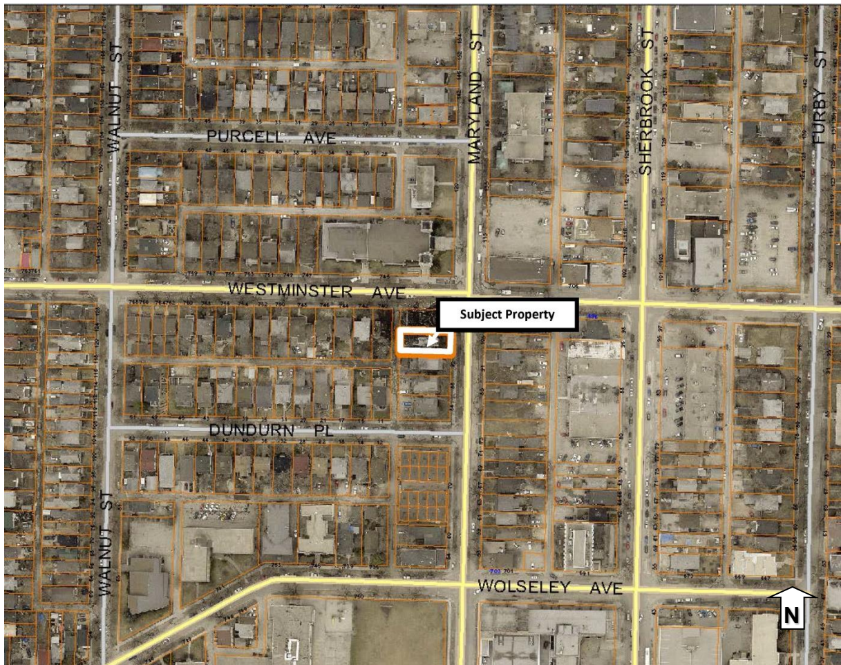
Figure 1: Aerial Photo of Subject Site and Surrounding Uses (flown 2016)

West: Rear lane, then single family uses (zoned “R2” Residential Two-Family)