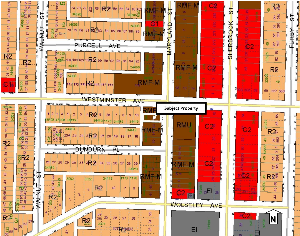
Figure 2: Existing zoning context