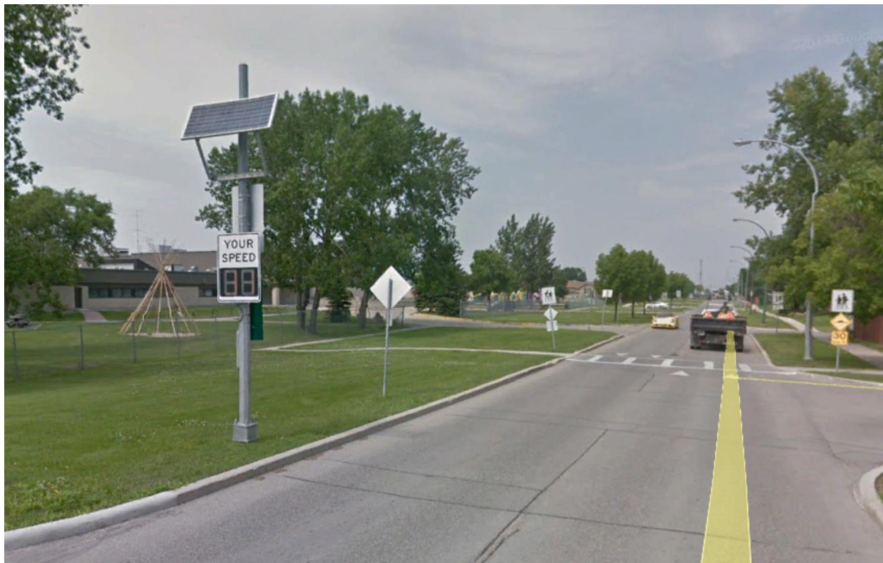
Figure 2: Speed Reader Board and Raised Crosswalk Installation at Bernie Wolf School on Bournais Drive