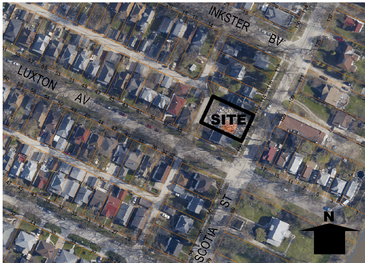
Figure 1: Subject Site (Aerial Flown 2009)