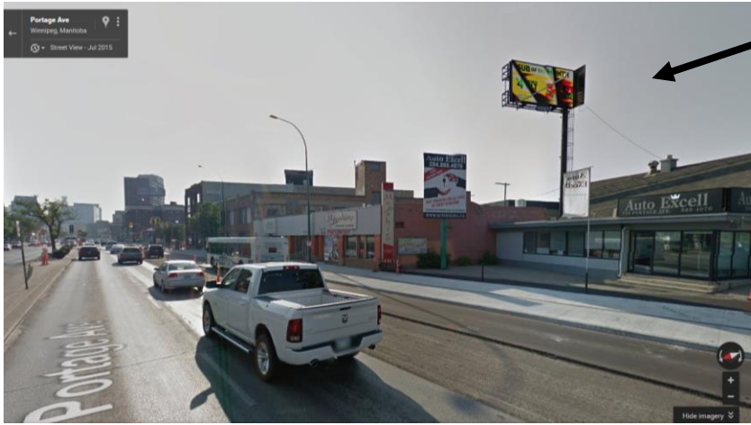
Portage Avenue looking east