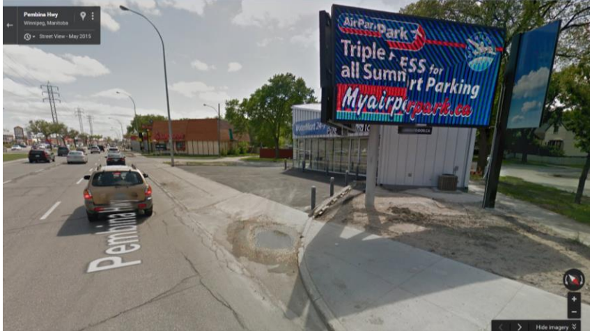
Pembina Highway looking south