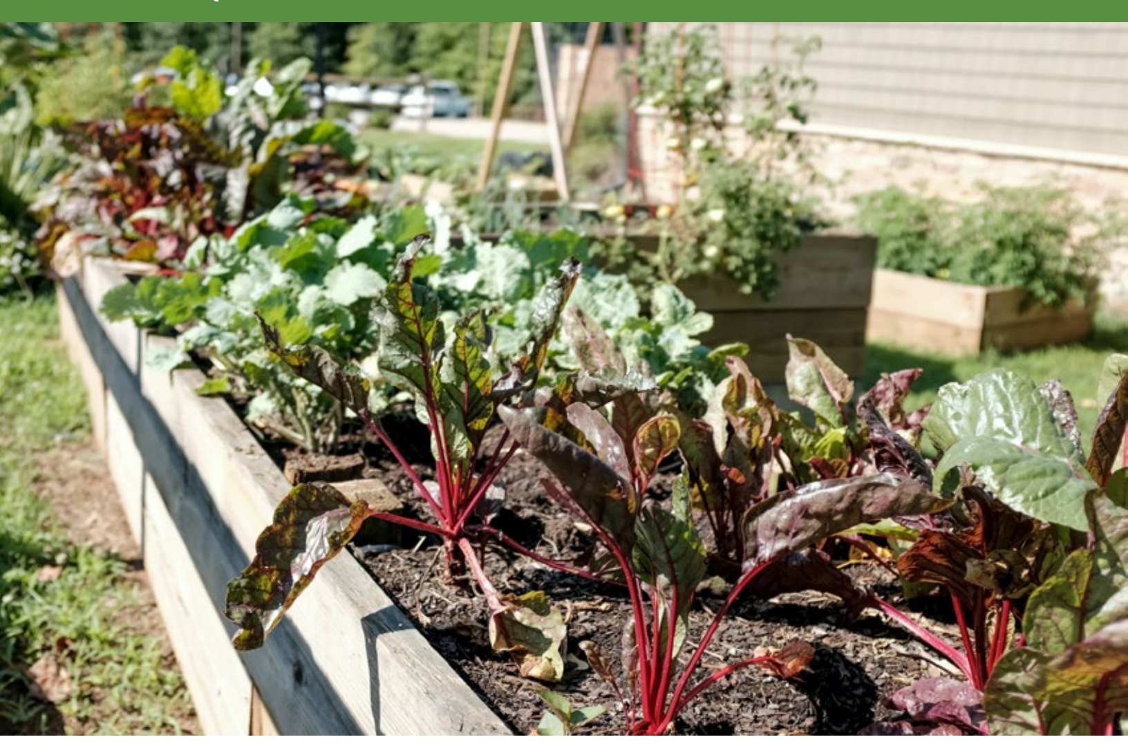
Indicator 22: Number of community-based food assets in the city

Rationale : Categorizing existing community food assets will guide future urban planning and help fulfill the good health and well-being outcomes in the OurWinnipeg2045 development plan.