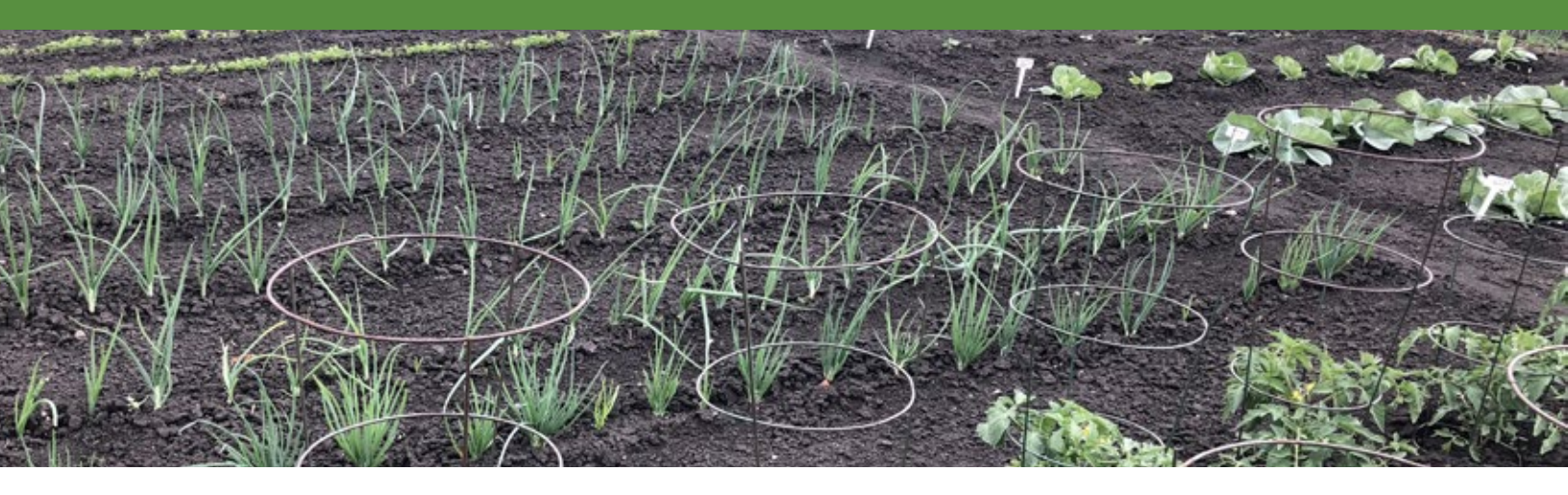
Indicator 4: Presence of an inventory of local food initiatives and practices to guide development and expansion of municipal urban food policy and programs

Rationale: Concrete examples of food policy and programmatic best practices can be used as a source of inspiration for locally adapted urban food programs, policy and practice.