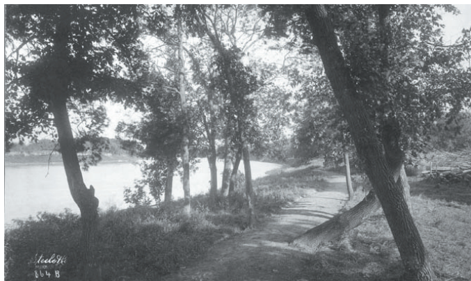
River Trail 1920

Assiniboine Park is time-honoured space for the rejuvenation of body, mind and spirit.