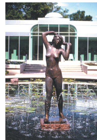
Leo Mol Sculpture Garden