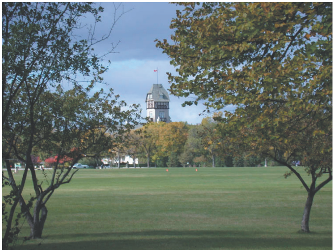
Children's Meadow and Pavilion 2003