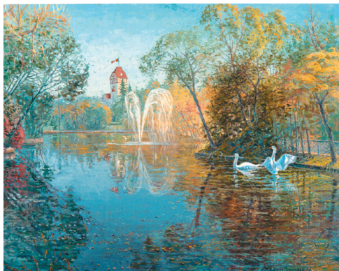
“Duck Pond at Assiniboine Park” by Roman Swiderek

“developing a strategic parks and open space management plan through public participation to meet emerging community needs.”