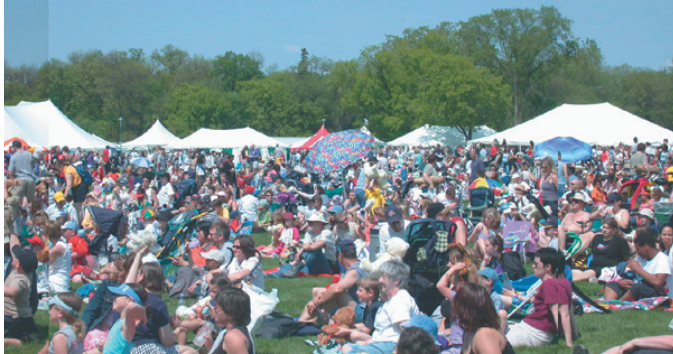
In 2003, over 50,000 people attended the annual Teddy Bears' Picnic in Assiniboine Park

Pedestrian n. a person on foot rather than in a vehicle.