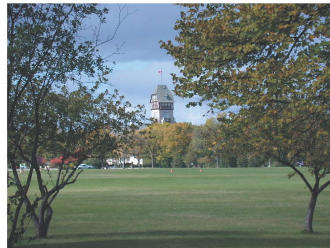
Children’s Meadow and Pavilion 2003