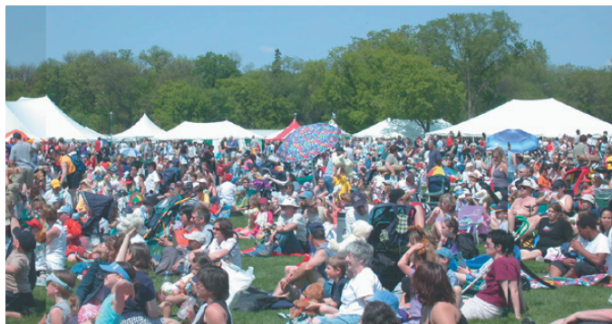
In 2003, over 50,000 people attended the annual Teddy Bears' Picnic in Assiniboine Park

Pedestrian n. a person on foot rather than in a vehicle.