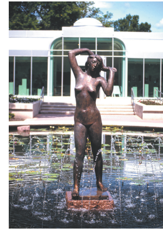
Leo Mol Sculpture Garden